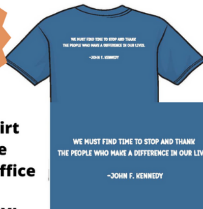
Back of T-Shirt

Please note all t-shirts will be mailed as a group to the county office to be distributed for your event.