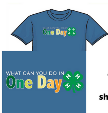
Front Center Chest

Available shirts are limited, be sure and order early!