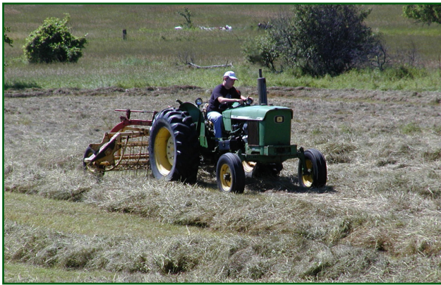
Figure 4. Dried forage being raked into windrows.

After cutting, the hay should remain in the field to dry or “field cure.” The dried or cured forage is then raked (Figs. 4 and 5) into windrows that are the width of the take-up header of the baler. Sometimes a heavy dew, high relative humidity, or rain will cause the windrow to be dry on top but wet underneath. When this happens you can use an implement called a tedder to turn the windrow over to help it dry (Fig. 6). Once the moisture content in the windrow has reached the appropriate level, the forage can be baled into round or square bales.