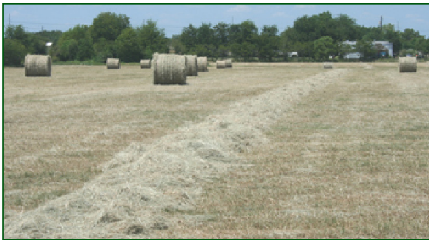
Figure 5. Dried forage after being raked into a windrow.