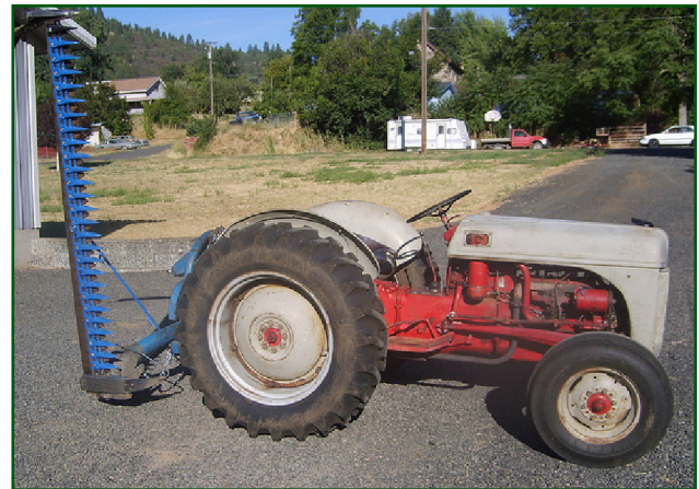
Figure 2. Sickle-bar type cutter.

The first step in hay production is the actual cutting of the hay. Hay mowers fall mainly into two classes — sickle-bar cutters (Fig. 2) and disk mowers (Fig. 3). Sickle-bar mowers have long cutting heads with reciprocating teeth. Disk mowers have cutting heads with several small rotating cutters. In the past, it was difficult to adjust cutting height and most mowers left a stubble height of 2 inches or less. Cutters today are more adjustable and a higher cut leaves some leaf material to support photosynthesis and encourages a more rapid recovery from the harvest.