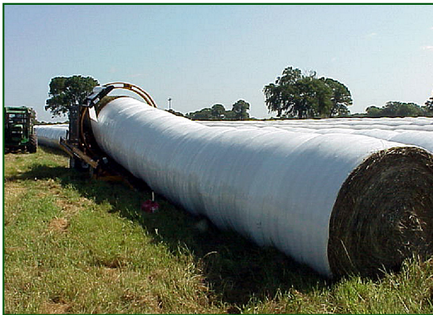
Figure 8. Multiple high moisture “haylage” bales being wrapped in plastic.

Haylage involves baling forage with 45 to 55 percent moisture content, then putting the bales into airtight storage. Haylage is typically wrapped in plastic to exclude air. Aerobic (free oxygen requiring) bacteria then consume the oxygen remaining inside the hay within a few hours. Under these conditions, anaerobic (non-free oxygen requiring) bacteria reduce the forage pH and preserve the forage in a more or less “pickled” state. The low pH inhibits mold and respiration losses that typically occur in high-moisture bales. Haylage does not, however, attain as low a pH as silage so it cannot be stored as long. The cost to wrap long strings of round bales (Fig. 8) or individual bales (Fig. 9) is about $5 to $7 per bale. While haylage reduces leaf shatter loss and allows you to preserve high-moisture forage, it is typically fed on-farm because it cannot be moved easily.