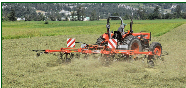
Figure 6. Tedder used for inverting dried forage to speed drying.