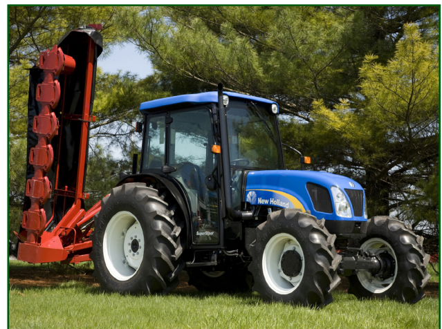
Figure 3. Disk mower cutter.