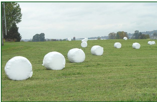
Figure 9. High moisture “haylage” bales individually wrapped in plastic.