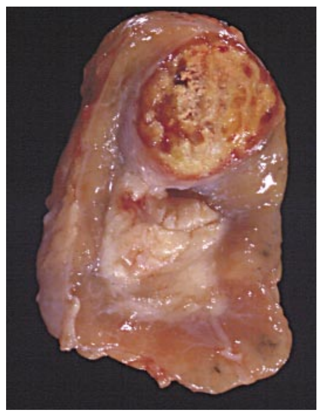
Tubercles destroy the tissue of internal organs.