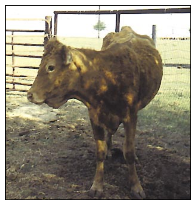
Bovine tuberculosis causes emaciation.

while biosecurity practices target the sources and transmission of diseases and the immunity of the cattle.