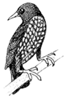
Figure 2. Starling.

Starlings are smaller than grackles (about the size of a robin) and have short, square tails. During the winter adult starlings are speckled with light dots, but they become more iridescent and less speckled during the breeding season. Juvenile starlings are a dusky, gray color.