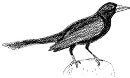
Figure 1. Common Grackle.

These large blackbirds are characterized by long, keel-shaped tails and yellow eyes. Male grackles often appear iridescent purple. They are about the size of a small crow and are very common in Texas. Grackles are frequently seen feeding in fields, lawns, golf courses and orchards. They nest wherever there is adequate cover such as trees in parks, yards, woodlots, orchards and marshes. Grackles are omnivorous, which means they feed on a variety of plant and animal matter. Insects make up the bulk of their diet during the spring and summer