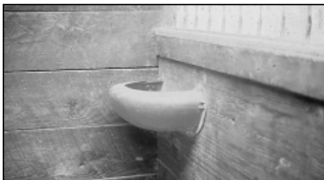
Individual feeding and carefully monitored feeding programs play a major role in maintaining arena performance horses.