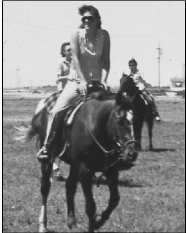
Nutrition influences a horse's body condition, bone strength and available nutrients to perform at various workloads.

For estimates of the energy needs of horses for various levels of work and for different stages of development, see Table 1. Notice also the impor-