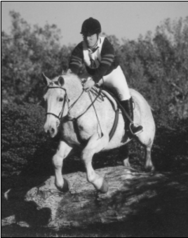
Many performance horses exceed the “light workload” classification and require energy to support a “moderate workload.”