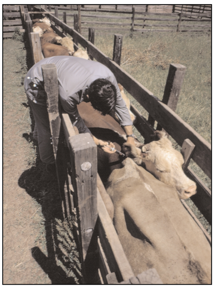
Crowd cattle in a lane chute to properly administer injections in the neck.

Noninfectious vaccines include killed vaccines, bacterins, toxoids, leukotoxoids and chemically altered, body temperature sensitive, modified live vaccines that are injected intramuscularly. To be effective, two doses of a noninfectious vaccine administered at a 2- to 4- week interval are necessary. The first vaccination is a priming,