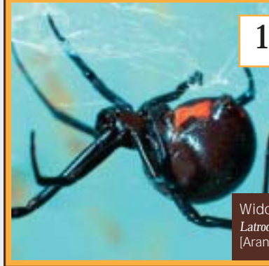
Widow Spiders Latrodectus spp. [Araneae: Theridiidae]