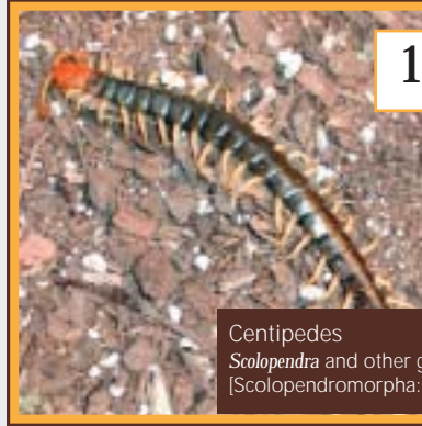
Centipedes Scolopendra and other genera [Scolopendromorpha: Scolopendridae]