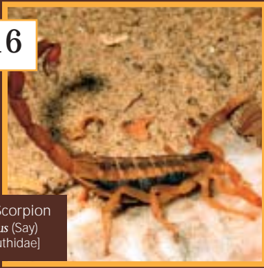
Striped Bark Scorpion Centruroides vittatus (Say) [Scorpionida: Buthidae]