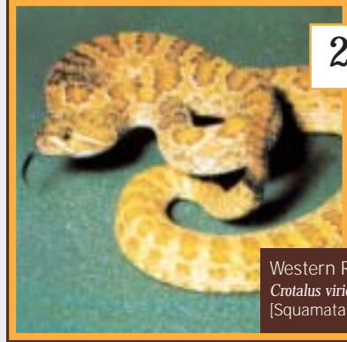
Western Rattlesnake Crotalus viridis (Rafinesque) [Squamata: Viperidae]