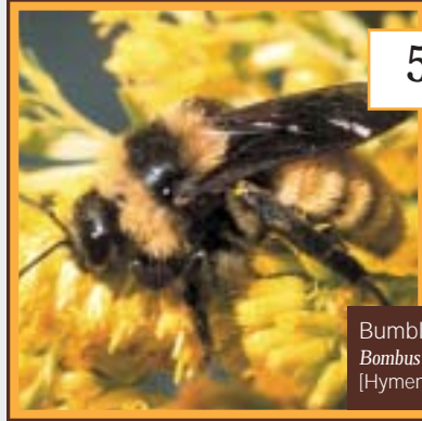
Bumble Bees Bombus spp. [Hymenoptera: Apidae]