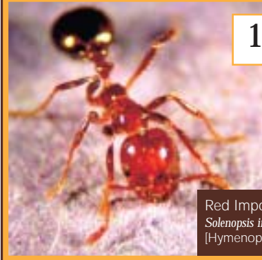
Red Imported Fire Ant Solenopsis invicta (Buren) [Hymenoptera: Formicidae]