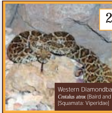
Western Diamondback Rattlesnake Crotalus atrox (Baird and Girard) [Squamata: Viperidae]