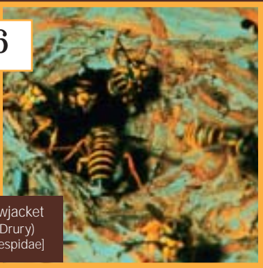
Southern Yellowjacket Vespula squamosa (Drury) [Hymenoptera: Vespidae]