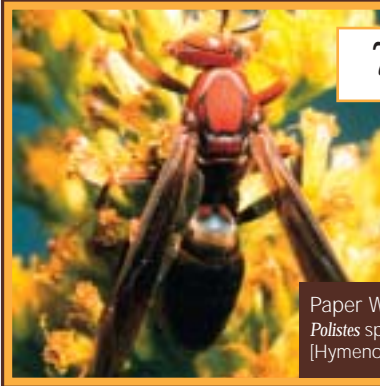
Paper Wasps Polistes spp. [Hymenoptera: Vespidae]