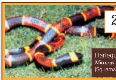
Harlequin Coral Snake Micrurus fulvius (Linnaeus) [Squamata: Elapidae]