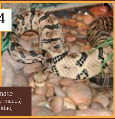
Timber Rattlesnake Crotalus horridus (Linnaeus) [Squamata: Viperidae]