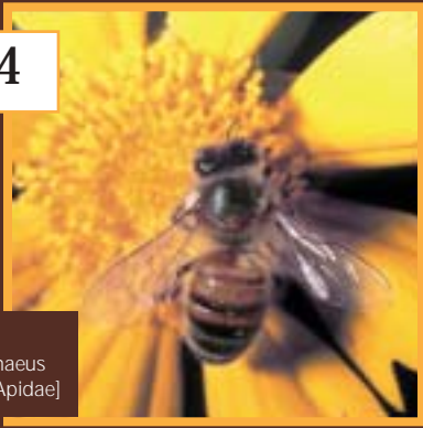
Honey Bee Apis mellifera Linnaeus [Hymenoptera: Apidae]