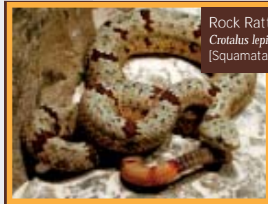
Rock Rattlesnake Crotalus lepidus (Kennicott) [Squamata: Viperidae]