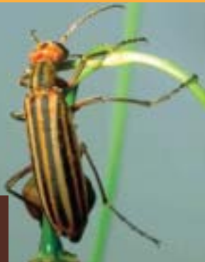
Blister Beetles Epicauta and other genera [Coleoptera: Meloidae]