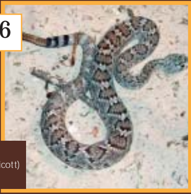
Mojave Rattlesnake Crotalus scutulatus (Kennicott) [Squamata: Viperidae]