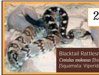
Blacktail Rattlesnake Crotalus molossus (Baird and Girard) [Squamata: Viperidae]