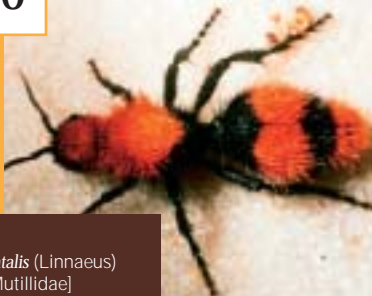
Red Velvet Ant Dasymutilla occidentalis (Linnaeus) [Hymenoptera: Mutillidae]