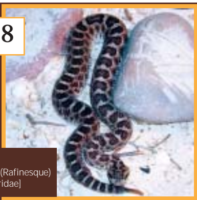
Massasauga Sistrurus catenatus (Rafinesque) [Squamata: Viperidae]