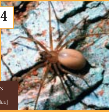
Recluse Spiders Loxosceles spp. [Araneae: Sicariidae]